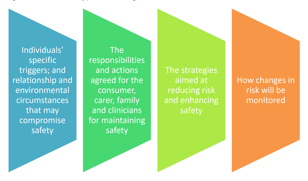
Figure 2: Elements of a safety plan for minimising escalation to acute behavioural disturbance